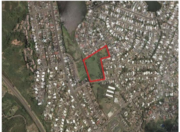
Exhibit 1. Location Map

Singer Home Builders (SHB) is proposing to develop the Awakea Apartment Homes on approximately 2 acres of land in Kailua, on the windward side of the island of O'ahu. These 128 fee-simple apartments will be constructed in two phases, with a total of 4 buildings completed by March 2010. Planned amenities for the proposed development include secured keycard entry system, trash chute, on-site resident manager, and a recreation building with meeting rooms and full kitchen.